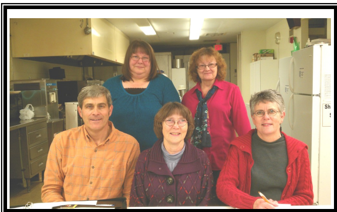
2012 SCCA Officers (from left to right)