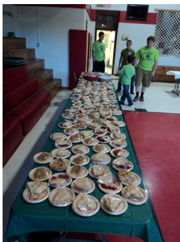
Homemade pies guarded by the Lodi Creative Critters.