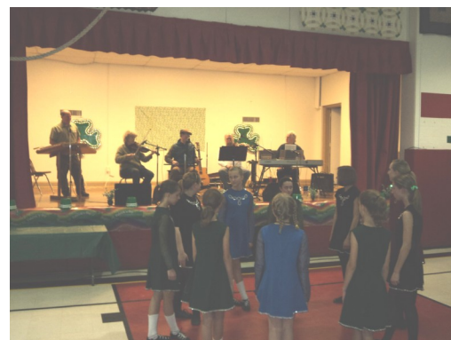
We all enjoyed the music of Boys of the Hock and Irish dancing by Athens Irish Dancers.