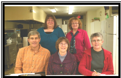
SCCA Officers for 2013 (from left to right)