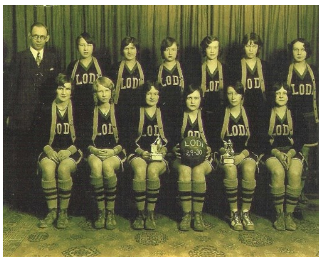
1929-30 Lodi girls' basketball team that had a record of 21-1 and won the Athens County Tournament