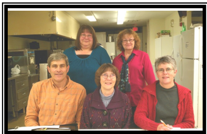
2012 SCCA Officers (from left to right)